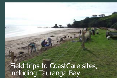
Field trips to CoastCare sites, including Tauranga Bay