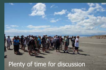
Plenty of time for discussion