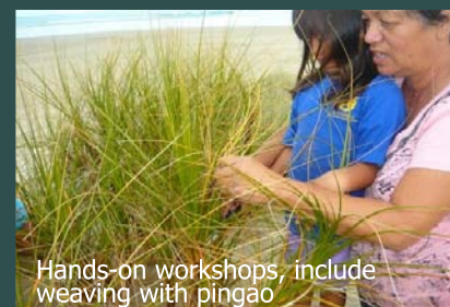
Hands-on workshops, include weaving with pingao